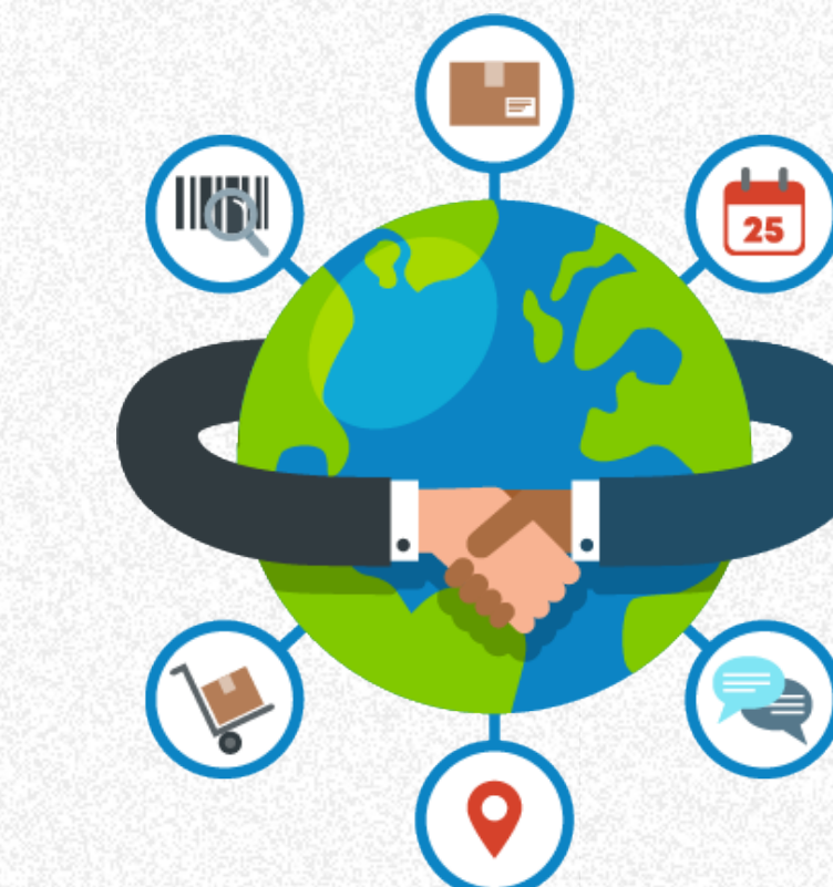
where the UK trades